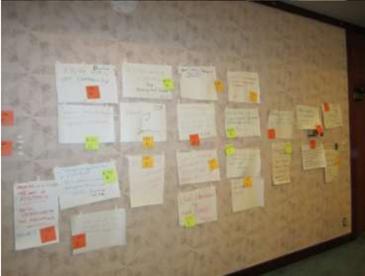
A work in progress! Open Space at work.