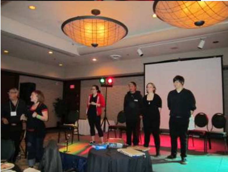
YouthCO Theatre Troupe working their magic during the Gala Night