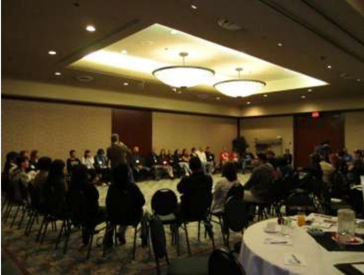
Preparing Delegates for the Open Space day ahead