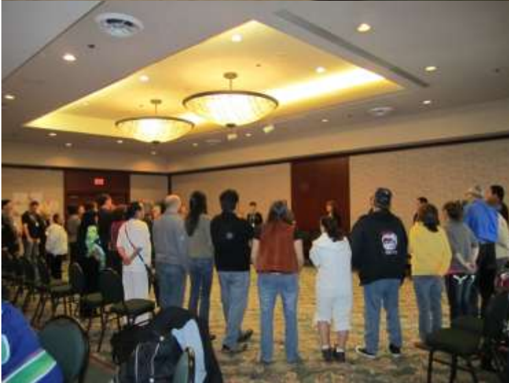
Wrapping up the first day.