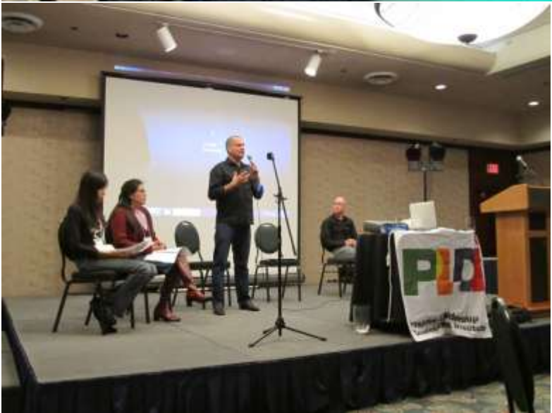
Positive Leadership Development Institute's Training seminar presentation on Day 2.